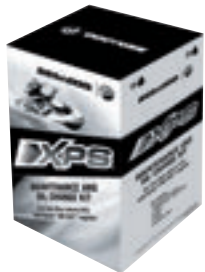
XPS 4-STROKE OIL CHANGE KIT P. 58