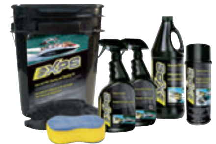
XPS BOAT & PWC CLEANING AND DETAILING KIT P. 59

Products available at your authorized participating Sea-Doo dealers only. Consult your authorized Sea-Doo dealer, a guarantee of excellence in the maintenance of your personal watercraft. Only authorized dealers can offer original BRP, Rotax and 100% Sea-Doo products and parts.