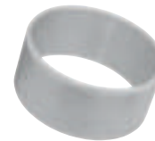
WEAR RING P. 56