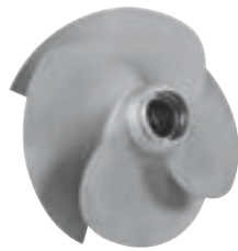
IMPELLER P. 56